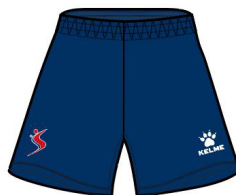
ASA Special Edition Uniform